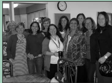
Rose Women's Organization members during a tour of Family Tree Women In Crisis safe shelter on September 14th.

Rose Women's Organization is committed to improving the health, education and welfare of women, children and families in the greater Denver community. The organization's 2011 grantmaking focus is on programs that support women and/or children around issues of domestic violence through crisis intervention and/or prevention.