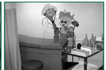
Images from Family Tree House of Hope (clockwise from top right) - outside view; kitchen; children's play room; health clinic.