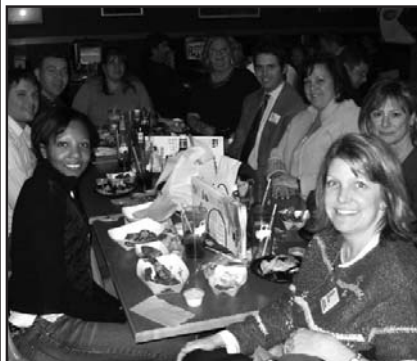
Staff and board members from Family Tree showed their support by having lunch at the Buffalo Wild Wings in Lakewood.